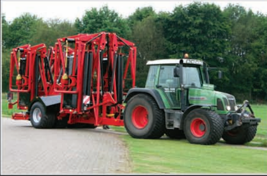
Transport , to facilitate stable transportation, the machine is equipped with rigid mechanical safety locks.