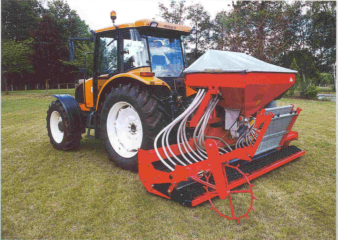
SMA 305 Primary Pneumatic Seeder notched rollers