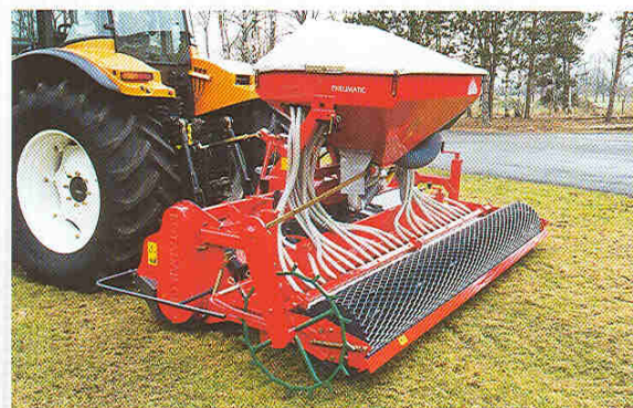
RotaDairon RX 220/250/300/400 Soil Renovator+ SMA Pneumatic seeder = Combi-Seeder RotaDairon RMA