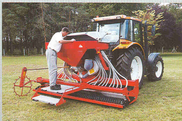
Platform on SMA 305 & 405 Primary Seeder for easy loading Floating rear roller ensuring consistent seed/soil contact