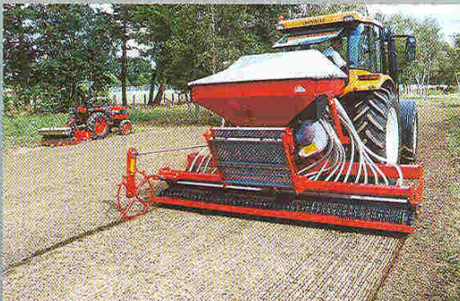
PRIMARY Pneumatic SEEDER